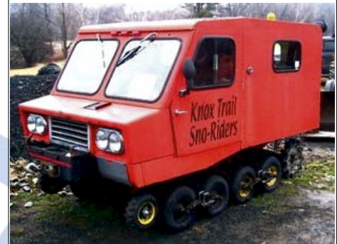
This old workhorse had seen better days but will now see a whole lot more!

Throughout the late Summer and Fall, a dedicated team of Club mechanics bolted, welded, painted, fabricated, and did all the other things necessary to reincarnate the Club's old Thiokol Groomer. A V-6 engine and automatic transmission replaced the old 4 cylinder and standard. Still to come is an electrically controlled hydraulic ram steer package. This system drastically improves control and durability while provided improved safety and ease of operation. A special note of thanks goes out to Roland Goulet of Sullivan Glass in Winsted for supplying the new windshield and rear door glass and weather-strip. The Thiokol will join the Bombi as the flagship groomers of the Knox Trail Sno-Riders!